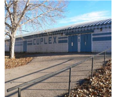
Cupar Memorial Rink